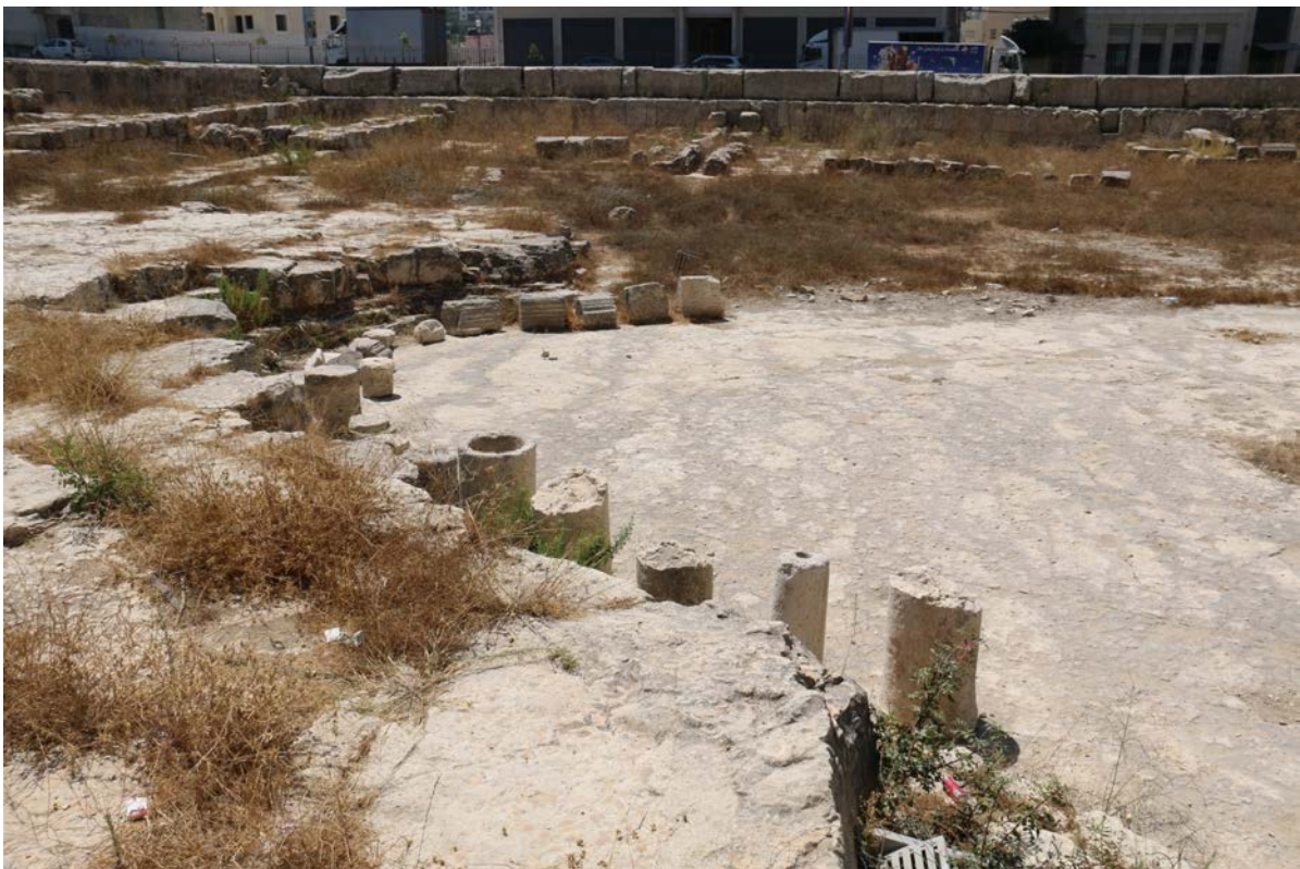
Figure 4 Remains of late antique columns and architectural ornaments, small altars, and vessels for libation sacrifices (and some modern rubbish), as now presented in the formerly open area of the sanctuary (photo: Katharina Heyden, 09/2019).