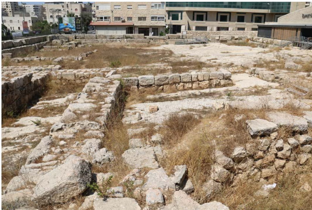
Figure 5 View from the east. In the foreground, the fundamentals of the apse and the adjoining rooms of the fourth-century Constantinian Basilica; in the upper left corner, the well and in front of it the area where the tree was located. At the back right, outside of the antique enclosure, the “Centre of Encounter”, built in 2015 but never put into operation (photo: Katharina Heyden, 09/2019).

daism, Islam, and Christianity (see Böttrich, Ego, and Eißler 2009), the place of Mamre/Rāmat al-Khalil is no longer a place of cultural memory and inter-religious hospitality. In fact, the once vibrant shared holy place decayed under Muslim rule, and after it was excavated by Christian and Jewish scholars in the twentieth century, the site is now threatened with being deserted again. In 2015, the Palestinian Ministry of Tourism, together with the UN and Jewish, Christian, and Muslim young people, made efforts to restore the site and revive it as a meeting place of historical importance. 65 But the newly built “meeting centre” was never put into operation.