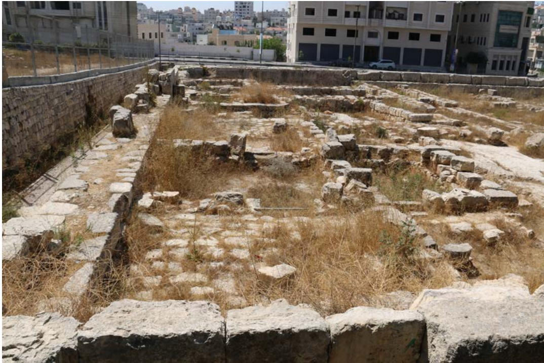
Figure 3 View from northeastern corner over the Constantinian structures. In the foreground, the “living rooms” of Abraham and Sarah. The large cubes of the enclosure wall at the lower edge of the picture are typically Herodian (photo: Katharina Heyden 09/2019).